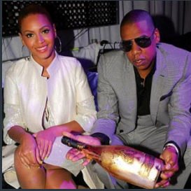
Jay-Z and Beyonce with the 'Ace of Spades'