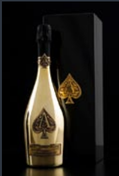
Armand de Brignac Brut The worlds #1 Champagne